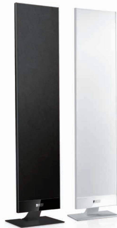
T301 and T301c speakers.

Mounted vertically as satellites (whether wall-mounted, on the desk stands supplied or the optional floor stands) or horizontally as a centre channel above or below the TV, the standard T Series speaker features KEF's new 115mm (4.5in.) ultra-low profile bass and midrange driver paired with the high performance new 25mm (1in.) vented tweeter.