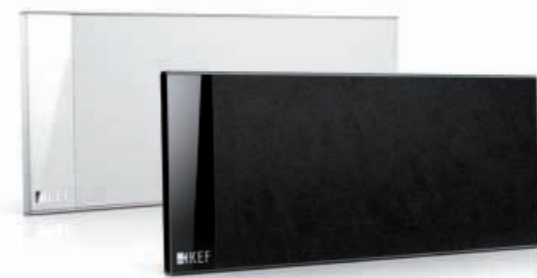
T101 and T101c speakers.

Mounted vertically as satellites (whether wall-mounted, on the desk stands supplied or the optional floor stands) or horizontally as a centre channel above or below the TV, the standard T Series speaker features KEF's new 115mm (4.5in.) ultra-low profile bass and midrange driver paired with the high performance new 25mm (1in.) vented tweeter.